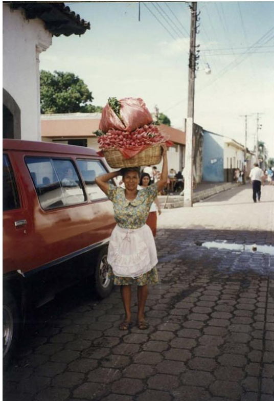
Street Vendor in El Salvador