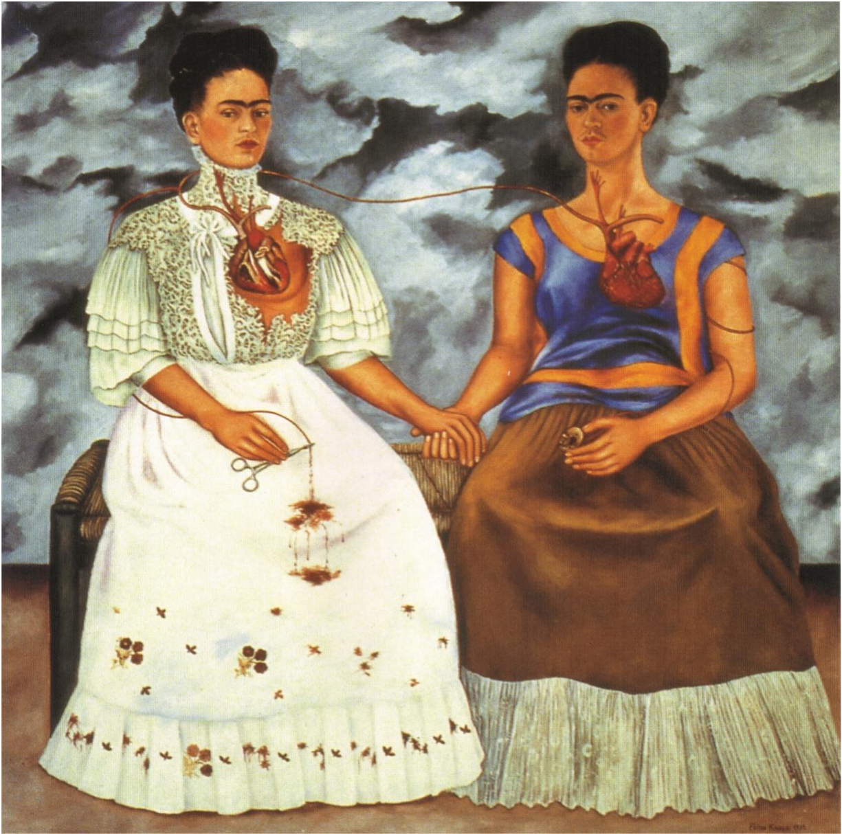
Frida Kahlo: Las Dos Fridas (The Two Fridas), 1939