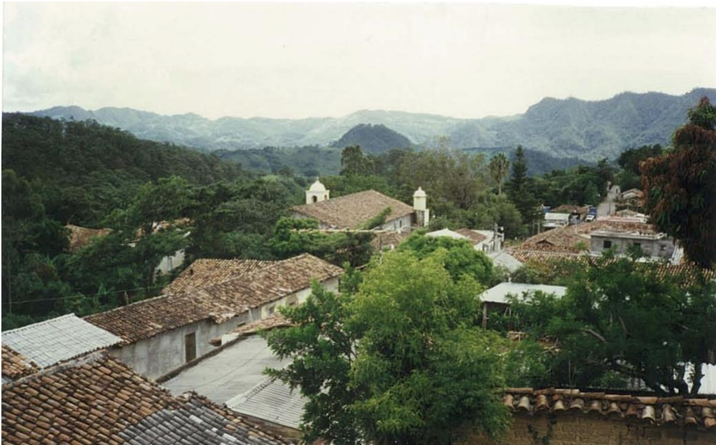
Mountain Village in El Salvador