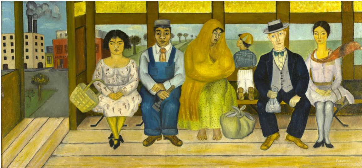
Frida Kahlo: El Camion (The Bus), 1929.